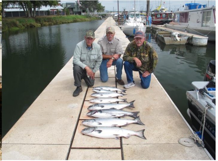
Past Buoy 10