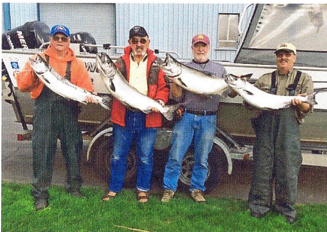
Close to a typical Tillamook Bay Fall Chinook catch at last year's Fish-Along.

The Tillamook Fairground Dorm is an ideal location for this event. It is located between the most popular Tillamook Bay boat ramps and is between the Wilson and Trask Rivers. There are also bank fishing opportunities just as close. There is water and 30 amp electrical service for RVs and plenty of parking for boats and other vehicles. It is just south of Highway 6 on Third Street, just off the Wilson River Loop Road. (Turn south off Highway 6 at Wilson River Loop Road. This road ends at the fairground with the two story bunk house to your right.) Bring your