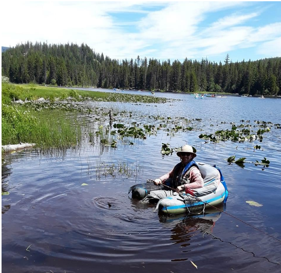
And, at Trillium Lake in July 2020!