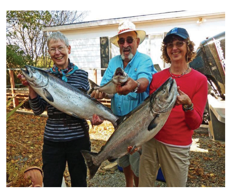
Happy Sandy Chapter members showing their catch.

who needs it as well as being a great weekend of fishing. Riders are expected to cover boat fuel, launch fees, and bait (which are only a portion of the boat owner's cost).