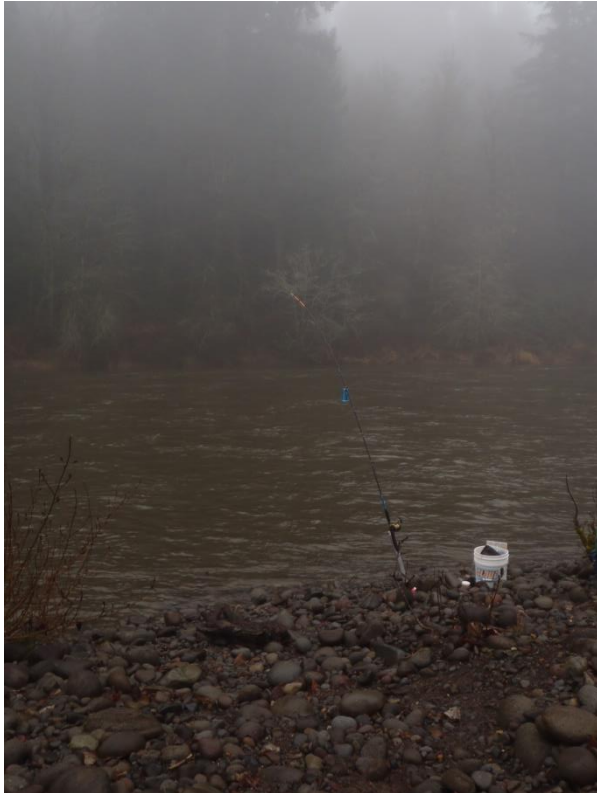
Plunking the flood plain

In an effort to extend fishing opportunity in a learning environment for recent graduates from the Chapter's November 2018 Steelhead Fishing 101 Workshop , I had the pleasure of hosting monthly winter steelhead Bank Fish Along s from December 2018 through April 2019! In total, we had 20 participants – an average of 4 for each event -- including veteran Chapter members who joined in! All outings were to Oxbow Regional Park's Flood Plain which provides plenty of good water to spread out and fish all the techniques one uses to chase winter steel: drift fishing, float fishing, bobber dogging, plunking and spinner/spoons.