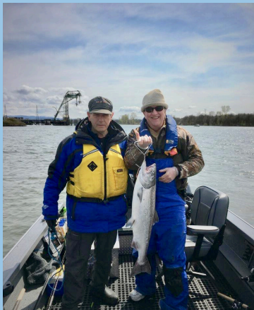
"Springer is what's for dinner"

It is that time of year. Springer fishing. There are two kinds of people in the world. Those that talk about springer fishing year-round and those that only talk about it mostly year-round. I think the first thread posted on a bulletin board such as ifish.net usually occurs in December. Someone is trying not to think about the Holiday Season and all the commotions that come along with it, so they instead focus on springer fishing. They feel that the springer season is just around the corner with the vigil for the "first springer of the season" that usually is caught around January 22nd most years, the 23rd in others.