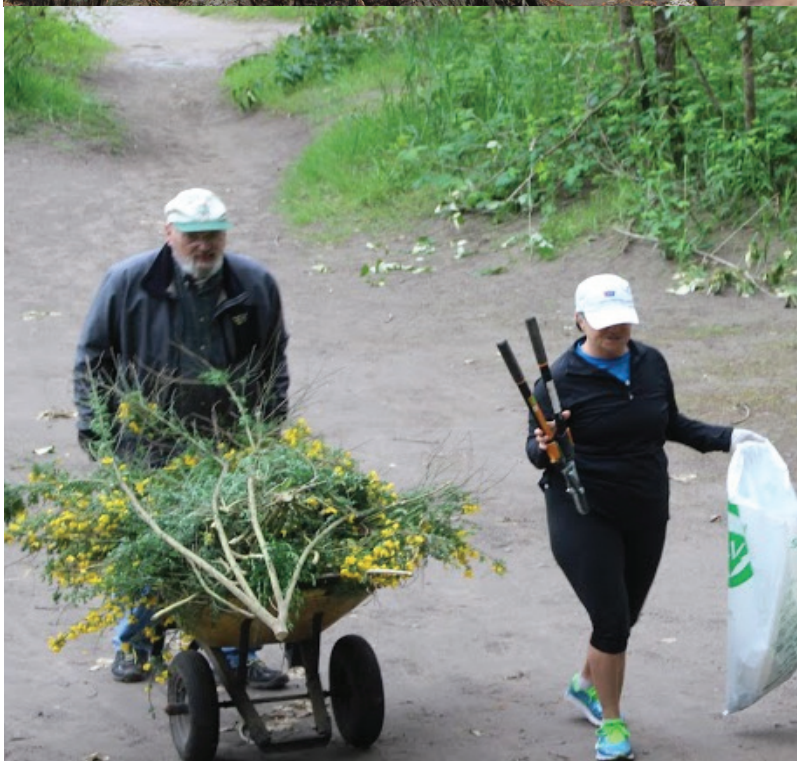
Clean-up Day at Glenn Otto, Lewis and Clark and Dabney parks