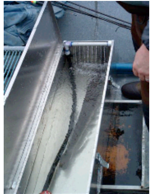
The collected hatchery fish resting quietly in the transportation box; the aerator keeping it supplied with Oxygen