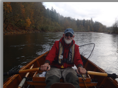
"Sometimes you Need and Excuse to Get Out".

One thing the Sandy River Chapter is blessed with is the many new members that have joined our ranks through the Steelhead Fishing 101 Workshops we put on in partnership with the Oregon Department of Fish and Wildlife. So, with all these new members, the table has been set for people to join forces by resolving to fish more in 2018! Okay, so it has been awhile since the workshop or the last Chapter meeting you attended and you have lost touch. Well, the Chapter has just the opportunity for you. Come to a Chapter Bank Fish-A-Long event. I will be hosting 3 this year – the first coming up right around the corner on Saturday, January 13th. The formula is meet at o'dark thirty for a hearty breakfast, get on the water and fish until Noon or so. I do my best to recruit some more experienced Chapter members to join us so for those seeking additional tips and pointers, help is just a cast away. What a great way to see who is available for future fishing adventures. Pre-registration is required.